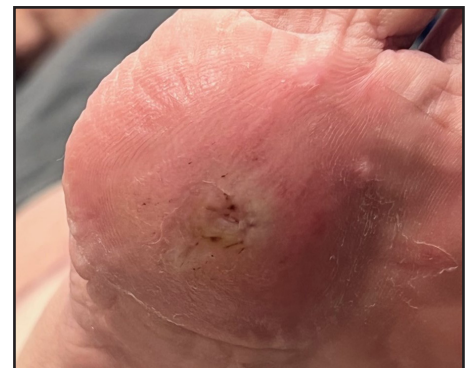
Wound Completely Closed After 3 Months, and Liposana is Palpable