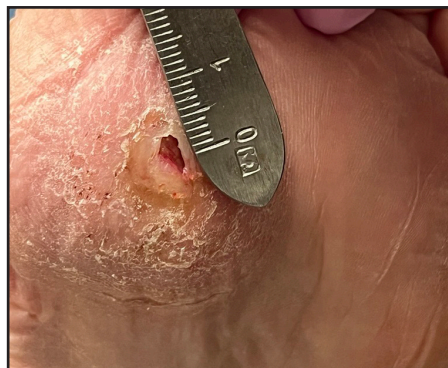
Week 5: Post 4 Applications (95% Reduction, Deep Tunneling Wound Has Fully Resolved)