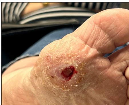
Week 2: Post 1 Application (72% Reduction, Deep Tunneling Wound Significantly Reduced)